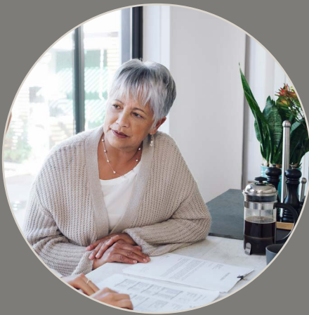
ADVOCATE4ME (UNITED HEALTHCARE)

UNITED HEALTHCARE OFFERS THE FOLLOWING PROGRAMS TO ITS MEMBERS