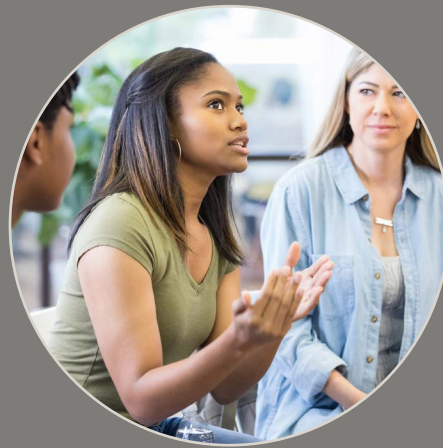
DISEASE MANAGEMENT SUPPORT PROGRAMS (UNITED HEALTHCARE)

Advocate4Me offers members service, support and access that goes above and beyond, helping to improve the health care experience, one person at a time. For more information, contact your UnitedHealthcare representative.